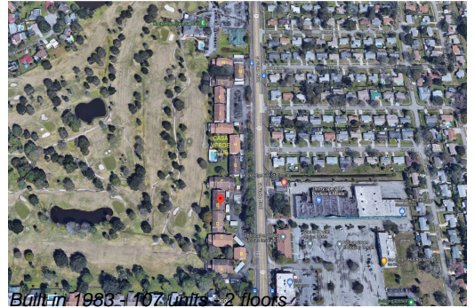
Built in 1983 - 107 Units - 2 floors