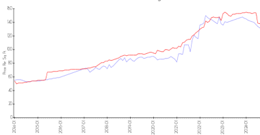
Preserve at Oakleaf Plantation (The) vs Orange Park