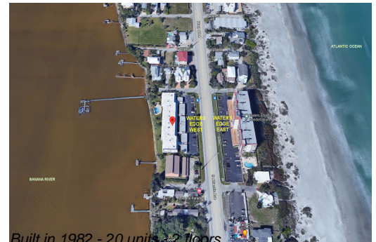
Built in 1982 - 20 units - 2nd floors