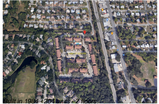
Built in 1984 - 204 units - 2 floors