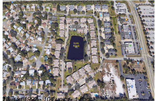
Built in 1992 - 104 units, 1 floor