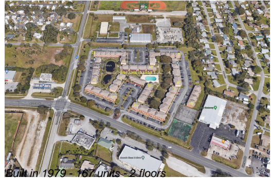
Built in 1979 - 167 units - 2 floors