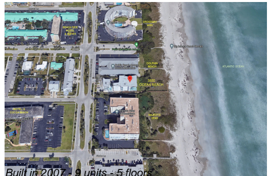
Built in 2007 - 9 units - 5 floors