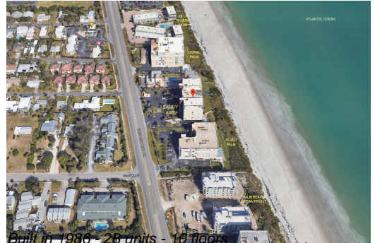
Built in 1986 - 26 units - 10 floors