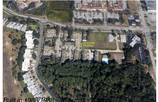
Built in 1983/1988 - 104 units