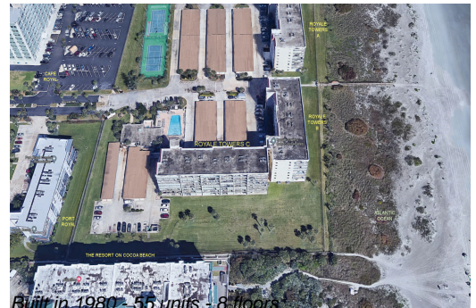
Built in 1980 - 55 units - 8 floors