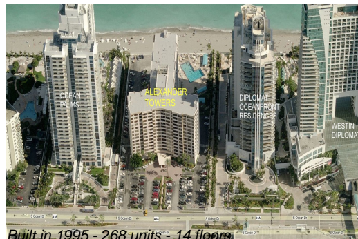
Built in 1995 - 268 units - 14 floors