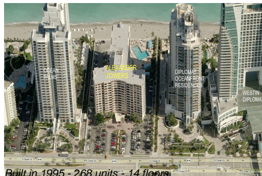
Built in 1995 - 268 units - 14 floors