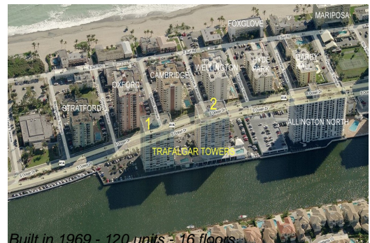
Built in 1969 - 120 units - 16 floors