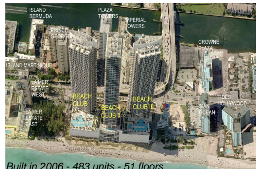
Built in 2006 - 483 units - 51 floors