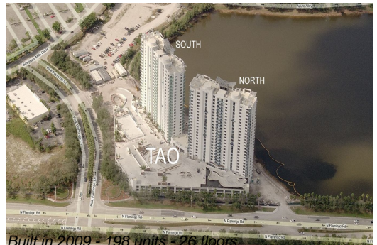
Built in 2009 - 198 units - 26 floors