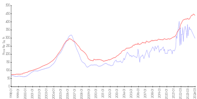
Allington Towers vs Hollywood Beach