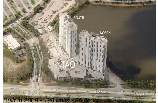
Built in 2009 - 198 units - 26 floors

The above valuated price is a baseline figure that does not take into account any specific renovation, upgrade, split, merge, or deterioration of the unit.