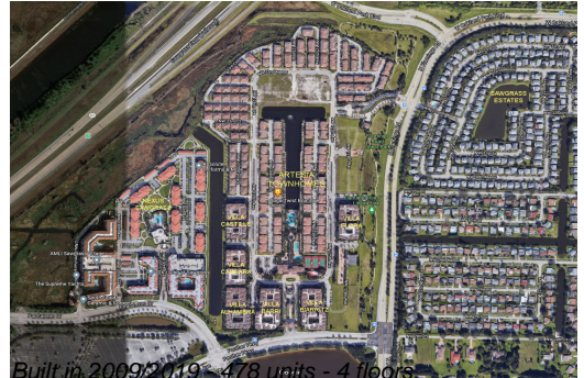
Built in 2009/2019 - 478 units - 4 floors