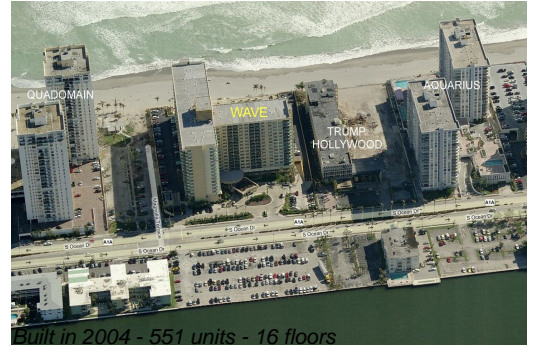
Built in 2004 - 551 units - 16 floors