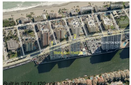
Built in 1971 - 120 units - 16 floors