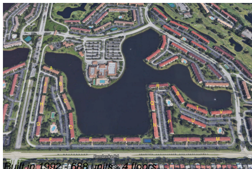
Built in 1992 = 688 units, 4 floors