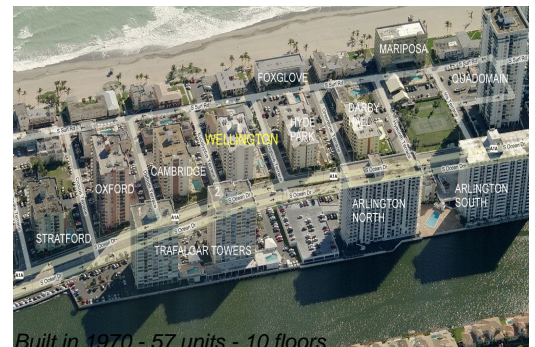
Built in 1970 - 57 units - 10 floors