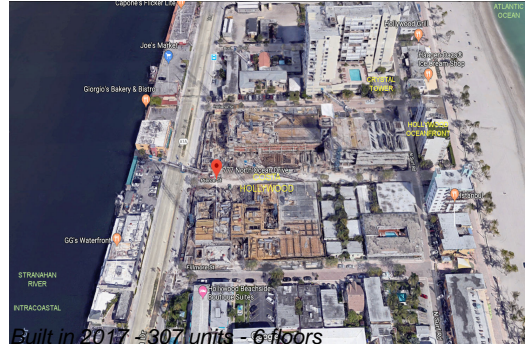
Built in 2017 - 307 units - 6 floors