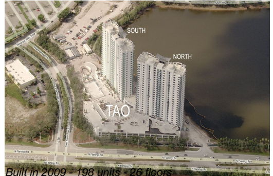
Built in 2009 - 198 units - 26 floors