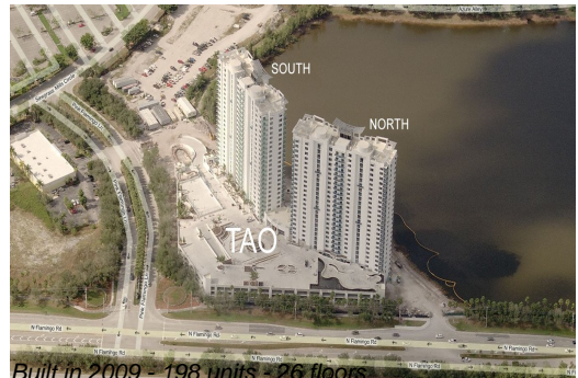
Built in 2009 - 198 units - 26 floors