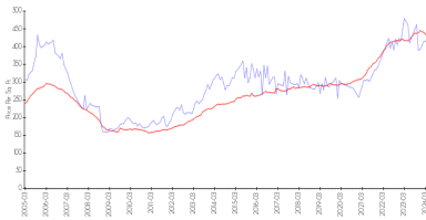
Residences on Hollywood East vs Hollywood Beach