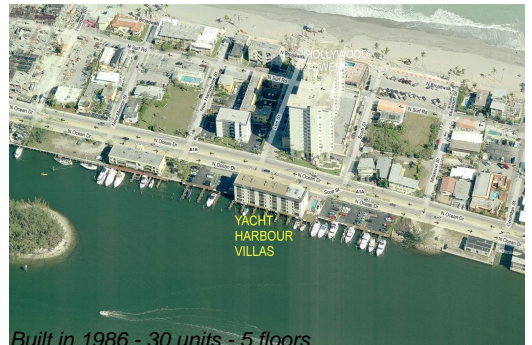
Built in 1986 - 30 units - 5 floors