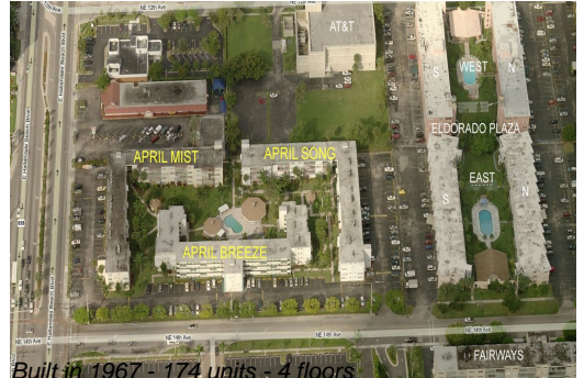
Built in 1967 - 174 units - 4 floors