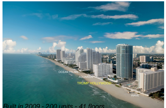
Built in 2009 - 200 units - 41 floors