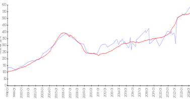
Shore Club Tower 2 (North) vs Fort Lauderdale