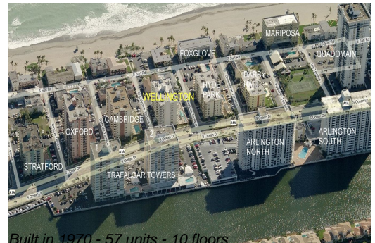
Built in 1970 - 57 units - 10 floors