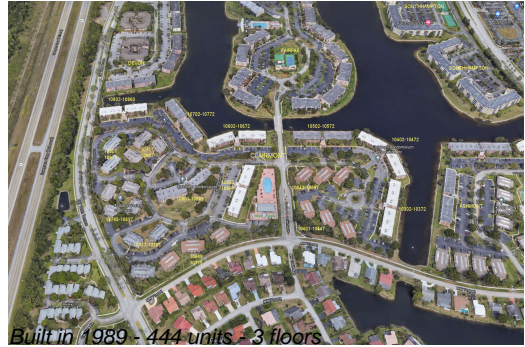
Built in 1989 - 444 units - 3 floors