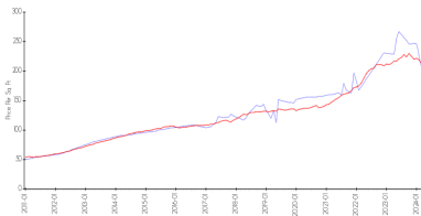
Garfield at Century Village (A-D) vs Pembroke Pines