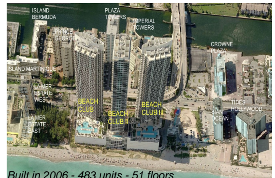
Built in 2006 - 483 units - 51 floors