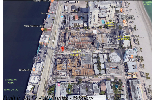
Built in 2017 - 307 units - 6 floors