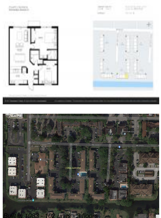
Built in 1983 - 102 units - 3 floors