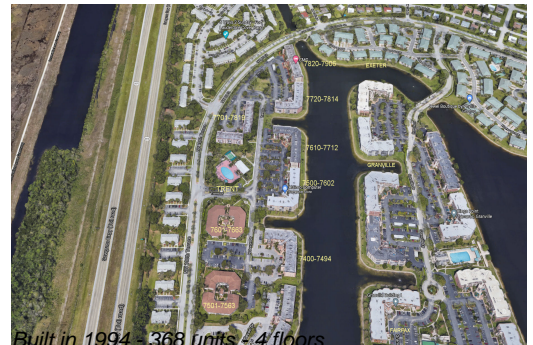
Built in 1994 - 368 units - 4 floors