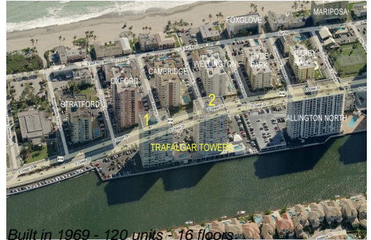
Built in 1969 - 120 units - 16 floors