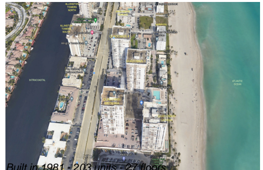
Built in 1981 - 203 units - 27 floors