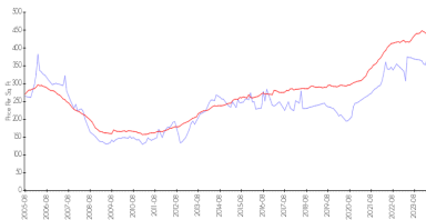
Residences on Hollywood West vs Hollywood Beach