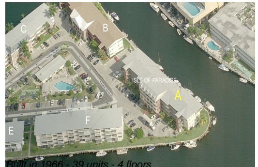
Built in 1966 - 39 units - 4 floors