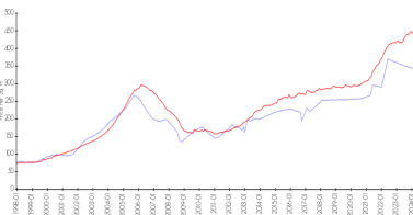
Stratford Towers vs Hollywood Beach