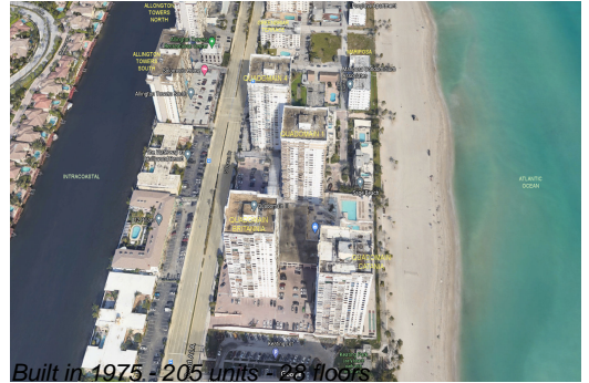
Built in 1975 - 205 units - 28 floors

The above valuated price is a baseline figure that does not take into account any specific renovation, upgrade, split, merge, or deterioration of the unit.