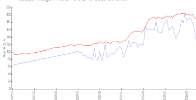
Lucaya Village (A to D - 1 & 2) vs Coconut Creek