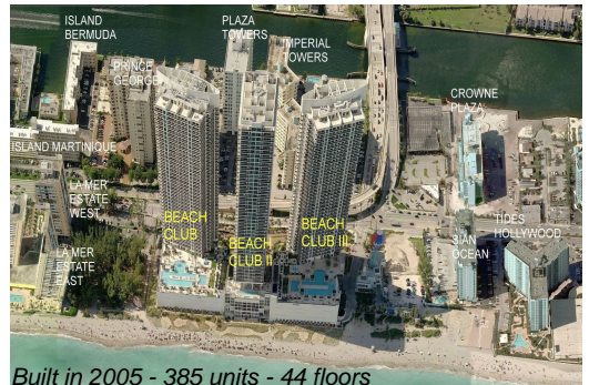
Built in 2005 - 385 units - 44 floors