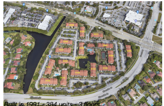
Built in 1991 - 384 units - 3 floors