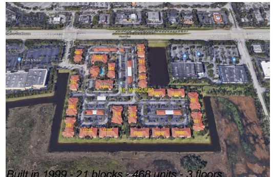
Built in 1999 - 21 blocks ~468 units - 3 floors