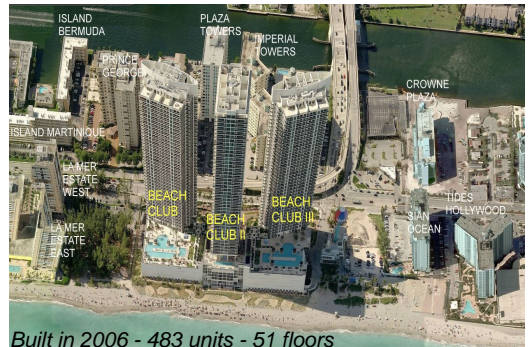
Built in 2006 - 483 units - 51 floors