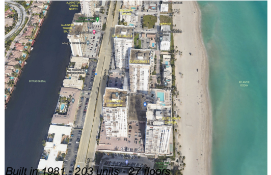
Built in 1981 - 203 units - 27 floors