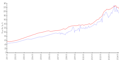
Kingsley at Century Village vs Pembroke Pines